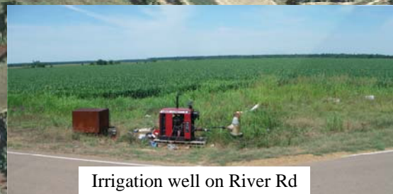
Irrigation well on River Rd