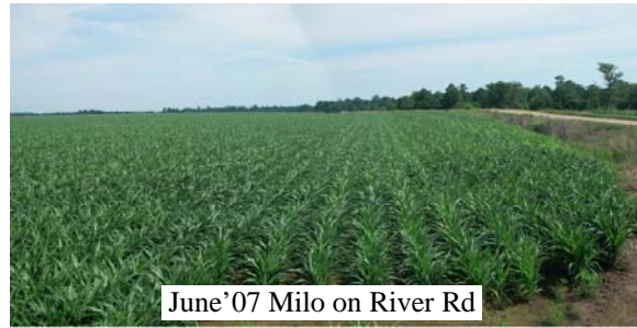
June '07 Milo on River Rd