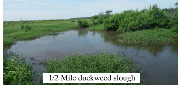
1/2 Mile duckweed slough

PURCHASE PRICE: $1,131,750.00 or $2,250.00 per acre