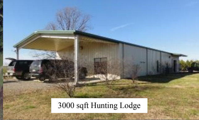
3000 sqft Hunting Lodge