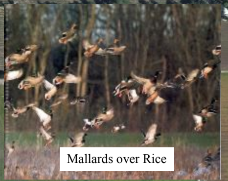
Mallards over Rice